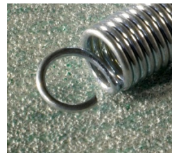
Cross Center Loop

The two most common types of loops are cross center and machine. However, loops can be made to virtually any configuration required.